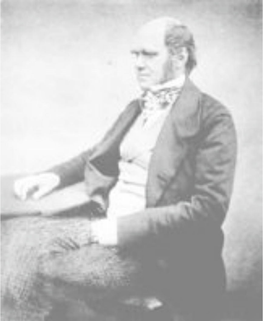
CHARLES DARWIN, AGE 52